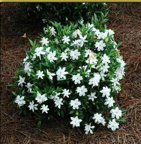
Radicans variety of dwarf gardenia.

Radicans – Ht. 6"-1', Spread 2-3'. A small, prostrate spreading variety with 1" fragrant double flowers.