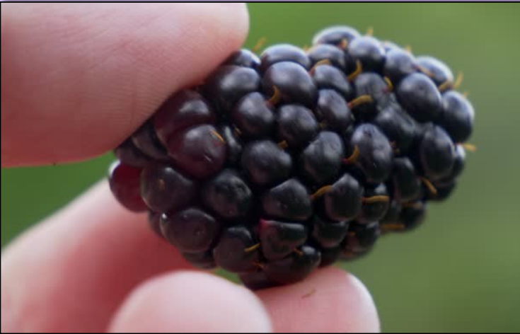
Each individual drupelet of a blackberry is a separate fruit.

Blackberries with small sections (called drupelets) that