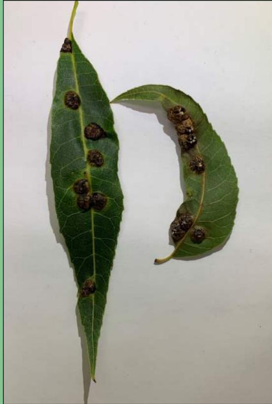
Pecan leaf infested with Southern Pecan Leaf Phylloxera top view (left) and underside view (right). Note the white tufts of hairs on the underside.

( Phylloxera russellae ). This species produces small galls between the secondary veins on the leaf surface. The galls are round and flattened, open on the ventral surface, and show a reticulated pattern on their surface. The opening is marked by dense, short, white hairs. The phylloxera produced from these galls lack wings as compared to other pecan phylloxera. The females crawl to protected places to lay their single egg. The egg is usually not completely laid by the female and remains attached to her dead body. There is one generation of galls per year.