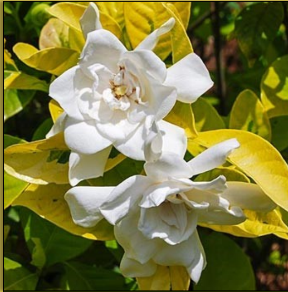
Gold Doubloon Gardenia

Belmont – Ht. 5-8', Spread 4-6'. Belmont is an older variety with heavily scented, double rose-like 4" flowers borne heavily from spring through early summer and sporadic rebloom.