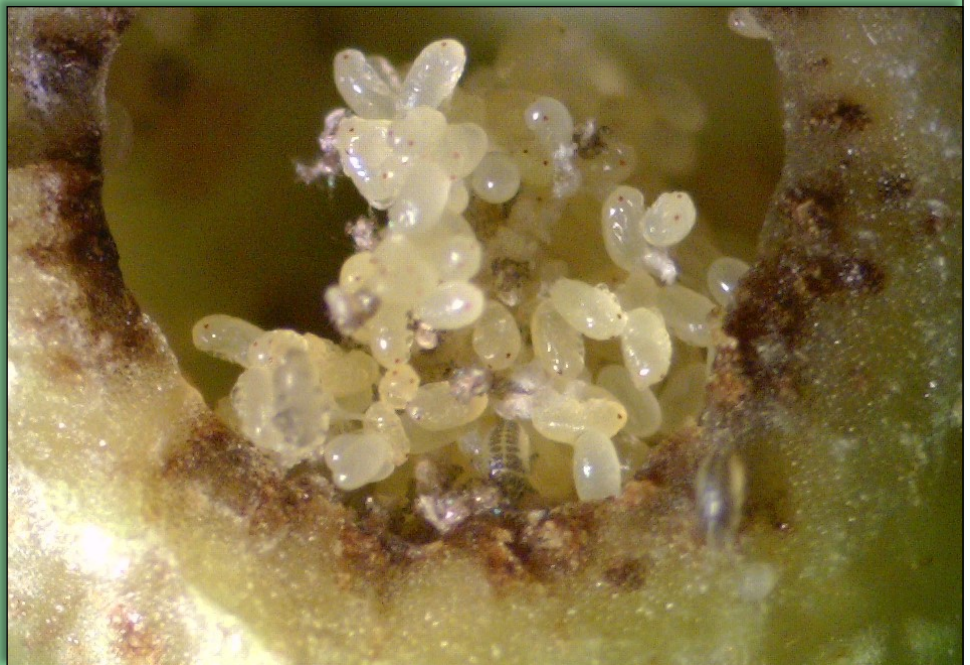
Eggs and imature Southern Pecan Leaf Phylloxera inside of a gall.