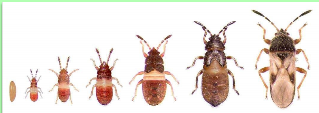
Image at left shows the life stages of a chinch bug from egg to adult.