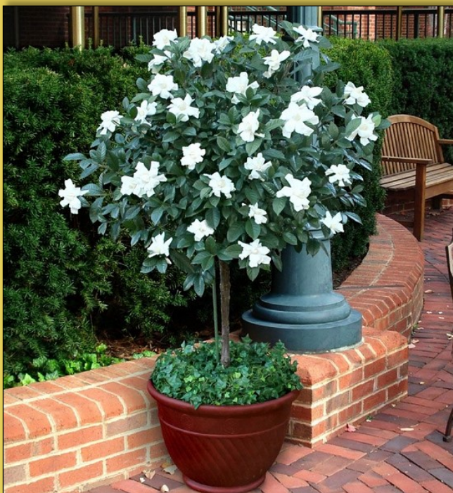
A tree form Aimee gardenia growing in a container. Note: container grown plants need more frequent watering and fertilization that those grown in the soil.

Gardenias are a favorite for wedding ceremonies with their elegant pure white blossoms and pleasant romantic fragrance. Gene Bussell in Southern Living described it thusly, "Sultry as a summer evening and as intoxicating as an exotic perfume, the scent of gardenias settles like a memory onto your soul." Give your gardenias a little care and they will bless you with years of romantic moonlit intoxicating strolls.