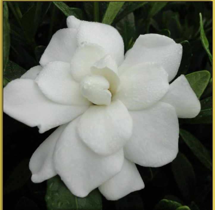
Double Mint gardenia flower.

Double Mint – Ht. 2.5-3', Spread 2.5-3'. A compact dense variety with 2" double flowers with repeat bloom throughout the summer.