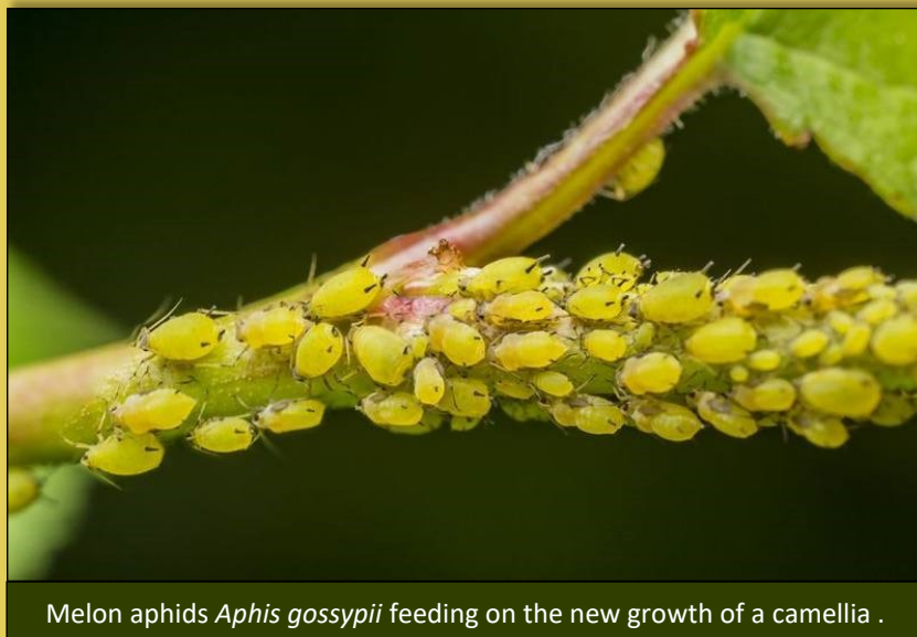
Melon aphids Aphis gossypii feeding on the new growth of a camellia .

Aphids (green peach Myzus persicae and melon Aphis gossypii ) are small (1/8”) soft-bodied pear-shaped insects that feed mainly on young tender tissue and cause distorted, curled or stunted